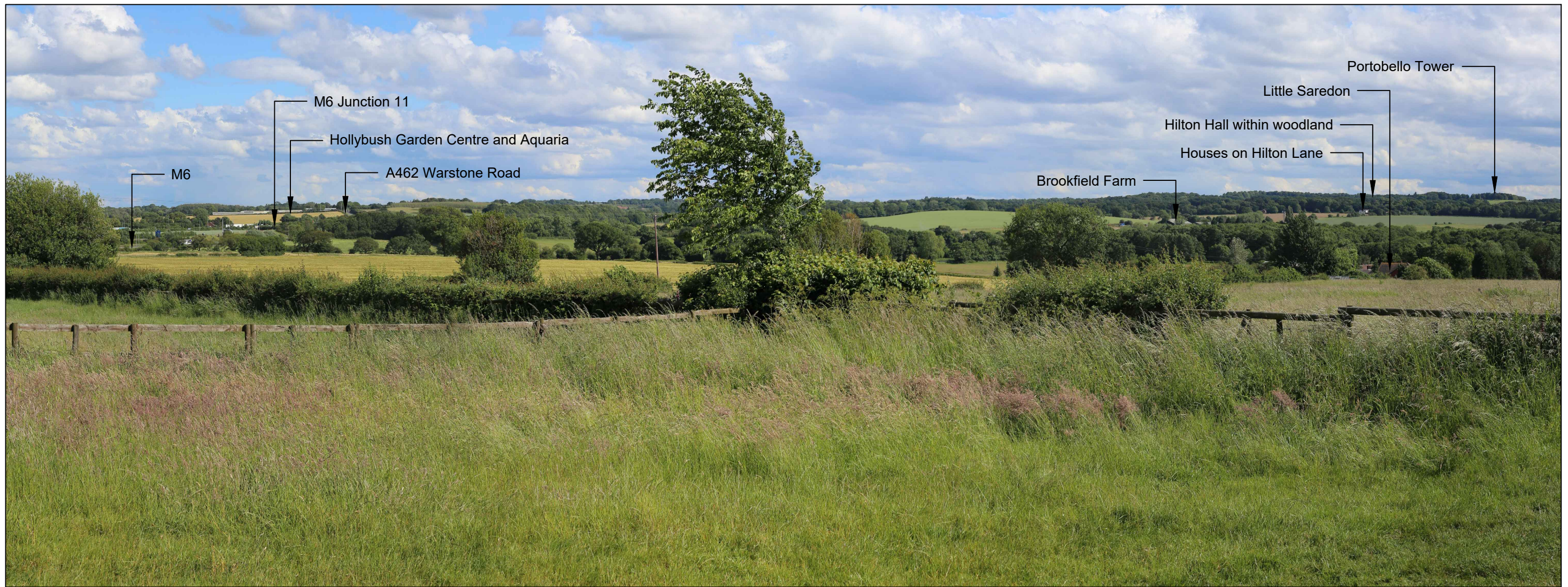
Extent of 50mm single frame image

Viewpoint number: 8 Location title: View from field gate along Great Saredon Road Camera model: Canon EOS 6D Focal length: 50mm Field of View: 65° (Horizontal) Camera height: 1.6m Photo taken: 20/06/2019 Coordinates: 394997,307545 Elevation: 147m AOD