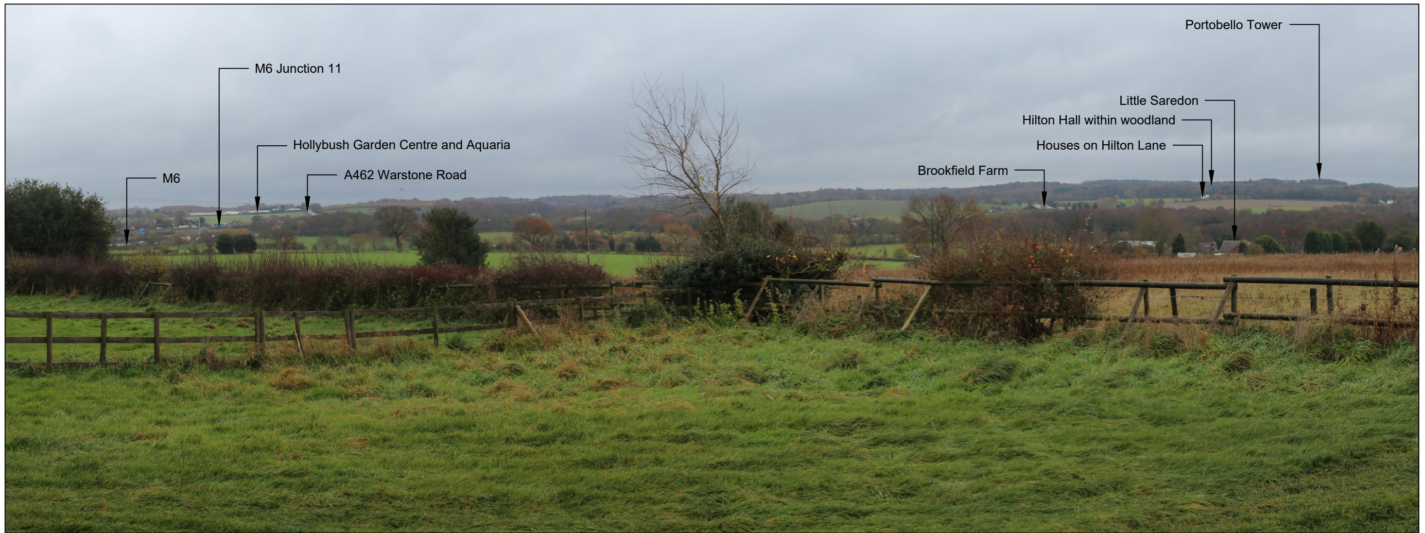
Extent of 50mm single frame image

Viewpoint number: 8 Location title: View from field gate along Great Saredon Road Camera model: Canon EOS 6D Focal length: 50mm Field of View: 65° (Horizontal) Camera height: 1.6m Photo taken: 20/11/2018 Coordinates: 394997,307545 Elevation: 147m AOD